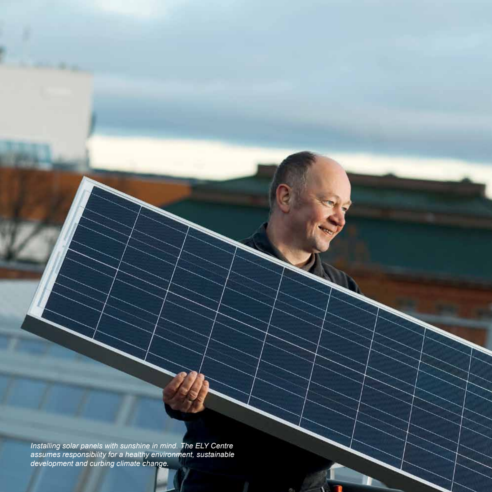
Installing solar panels with sunshine in mind. The ELY Centre assumes responsibility for a healthy environment, sustainable development and curbing climate change.