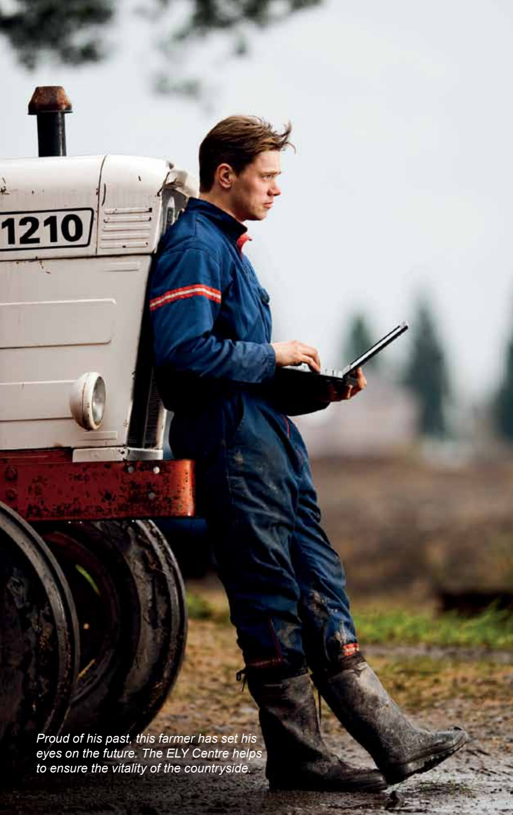
Proud of his past, this farmer has set his eyes on the future. The ELY Centre helps to ensure the vitality of the countryside.