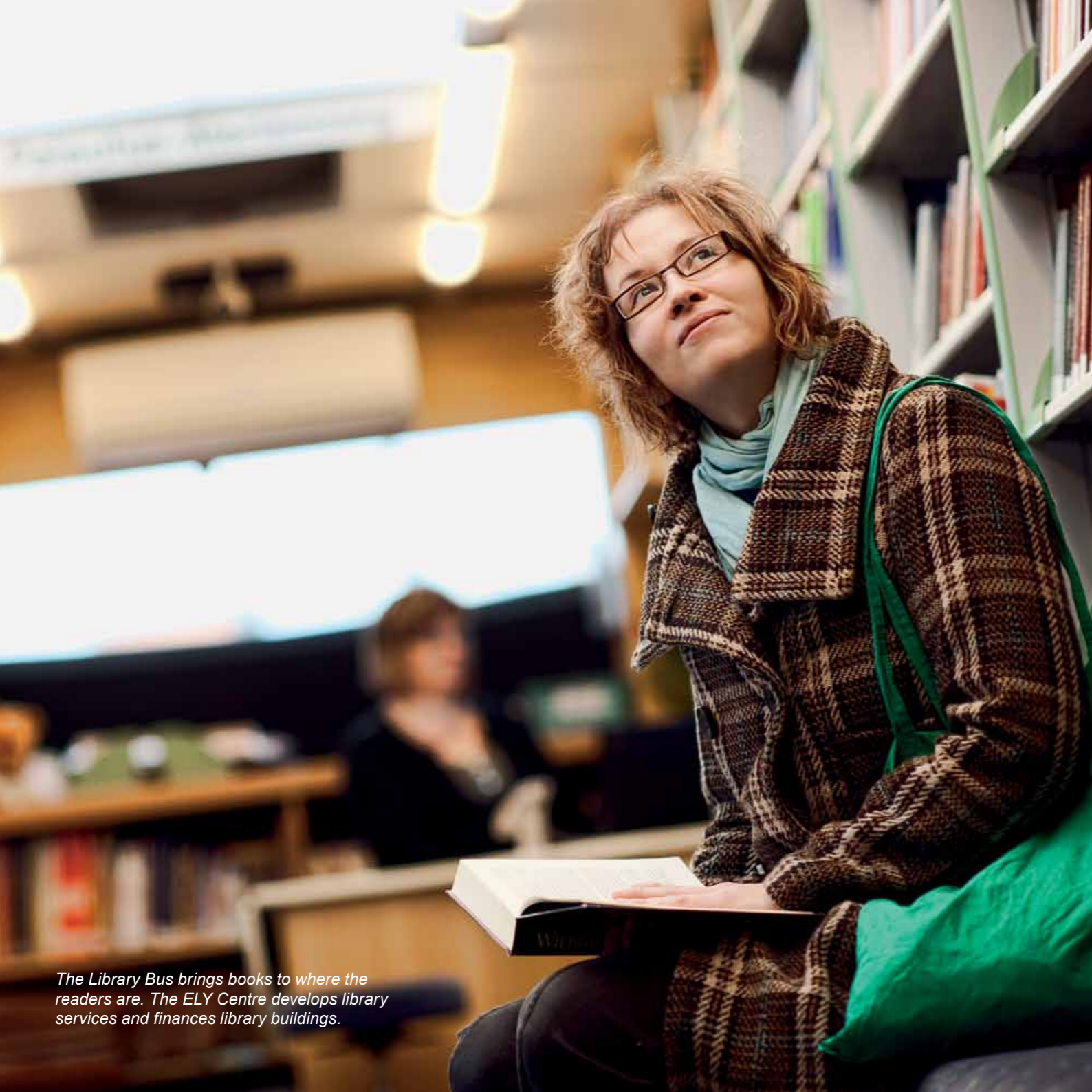
The Library Bus brings books to where the readers are. The ELY Centre develops library services and finances library buildings.