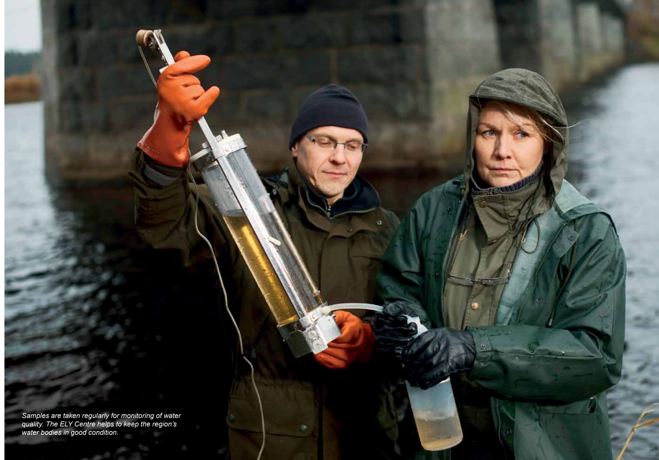
Samples are taken regularly for monitoring of water quality. The ELY Centre helps to keep the region's water bodies in good condition.

Environmental information for enterprises: www.yrityssuomi.fi/web/enterprise-finland